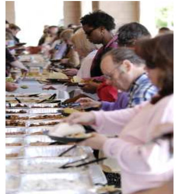
About 300 people enjoyed the meal catered by Qdoba Restaurant.