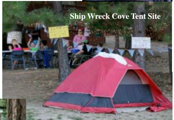
Ship Wreck Cove Tent Site