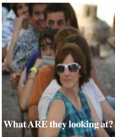
What ARE they looking at?