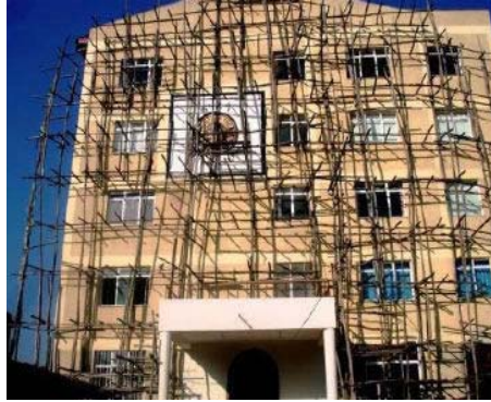
Addis Ababa, Ethiopia

September is one of two months each year that we emphasize the Alabaster Offering (February is the other). Hundreds of buildings have been built around the world for the furtherance of the Gospel because of Alabaster funds. Here are pictures of the Nazarene Ministry Center in Addis Ababa, Ethiopia and the Ashrafieh Church of the Nazarene in Amman, Jordan, both built with the help of Alabaster funds.