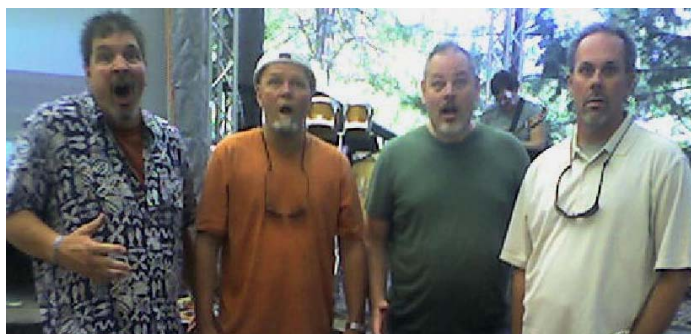
That's right, fellas. Camp's over. We'll see you next year!